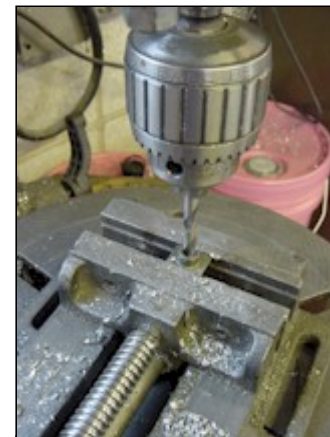
Figure 2. Drill Rear Fender Nuts