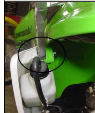
Figure 3. Side Panel/Fender Trim Location